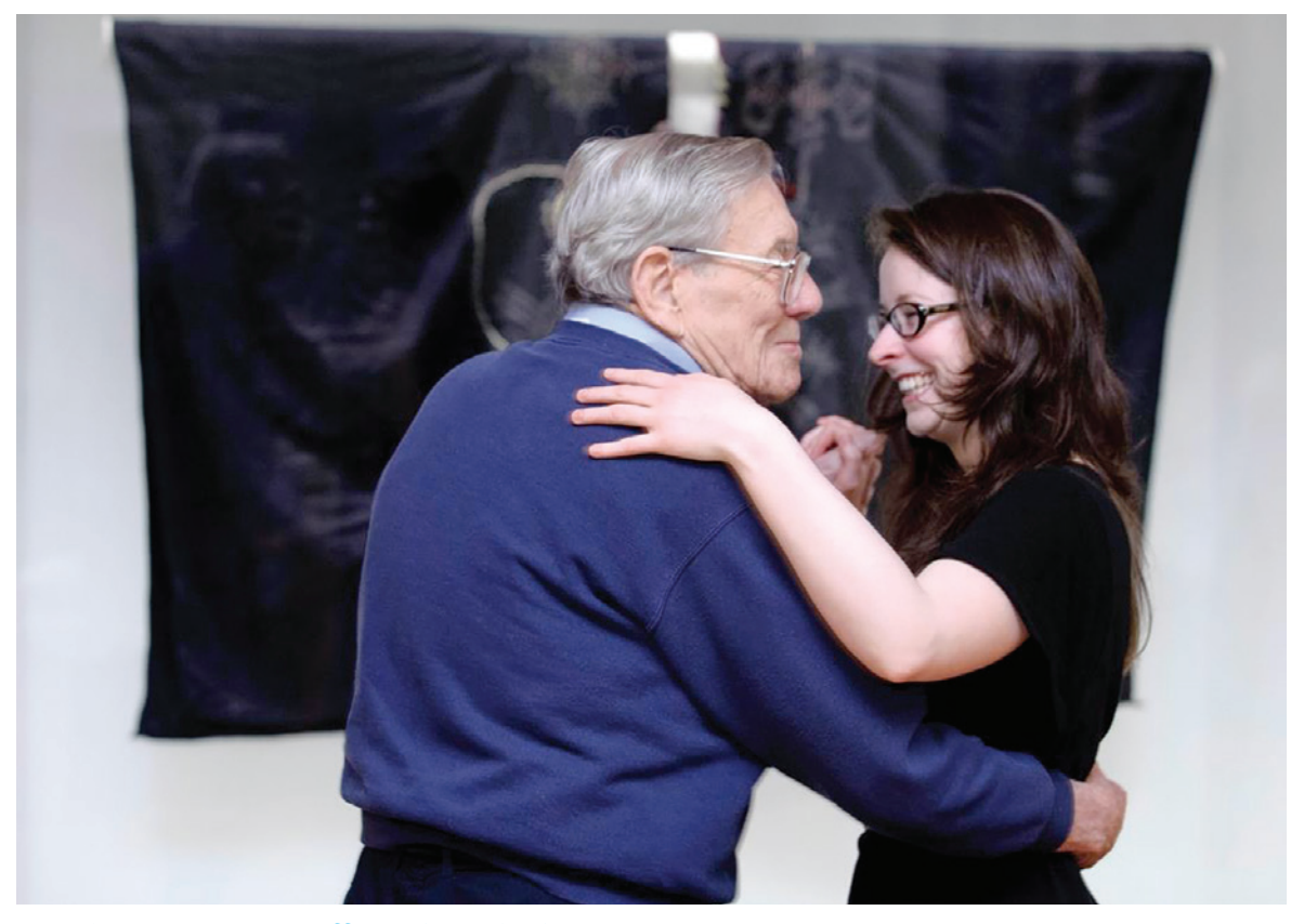
Manchester Museum: Coffee, cake and culture