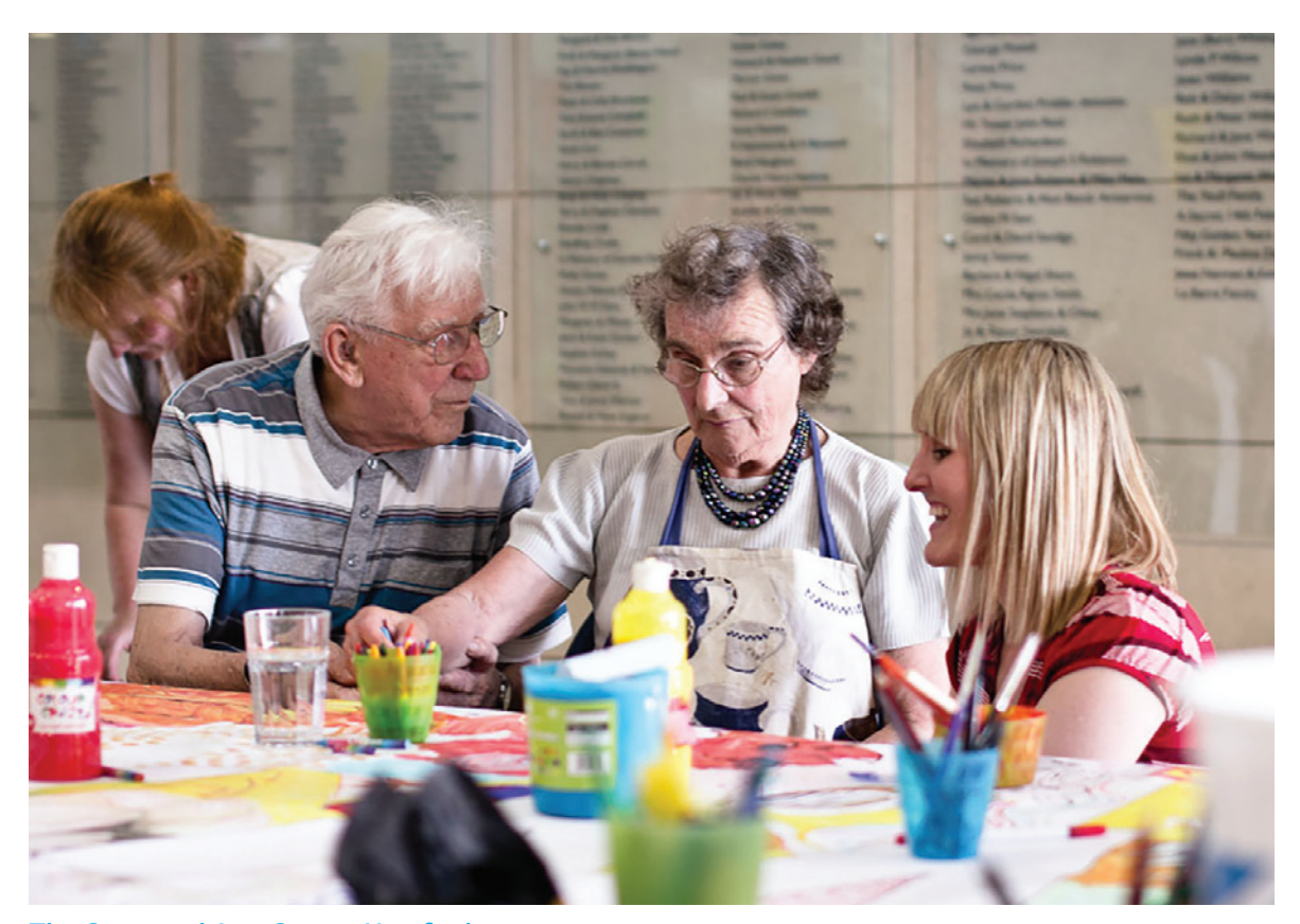
The Courtyard Arts Centre, Hereford