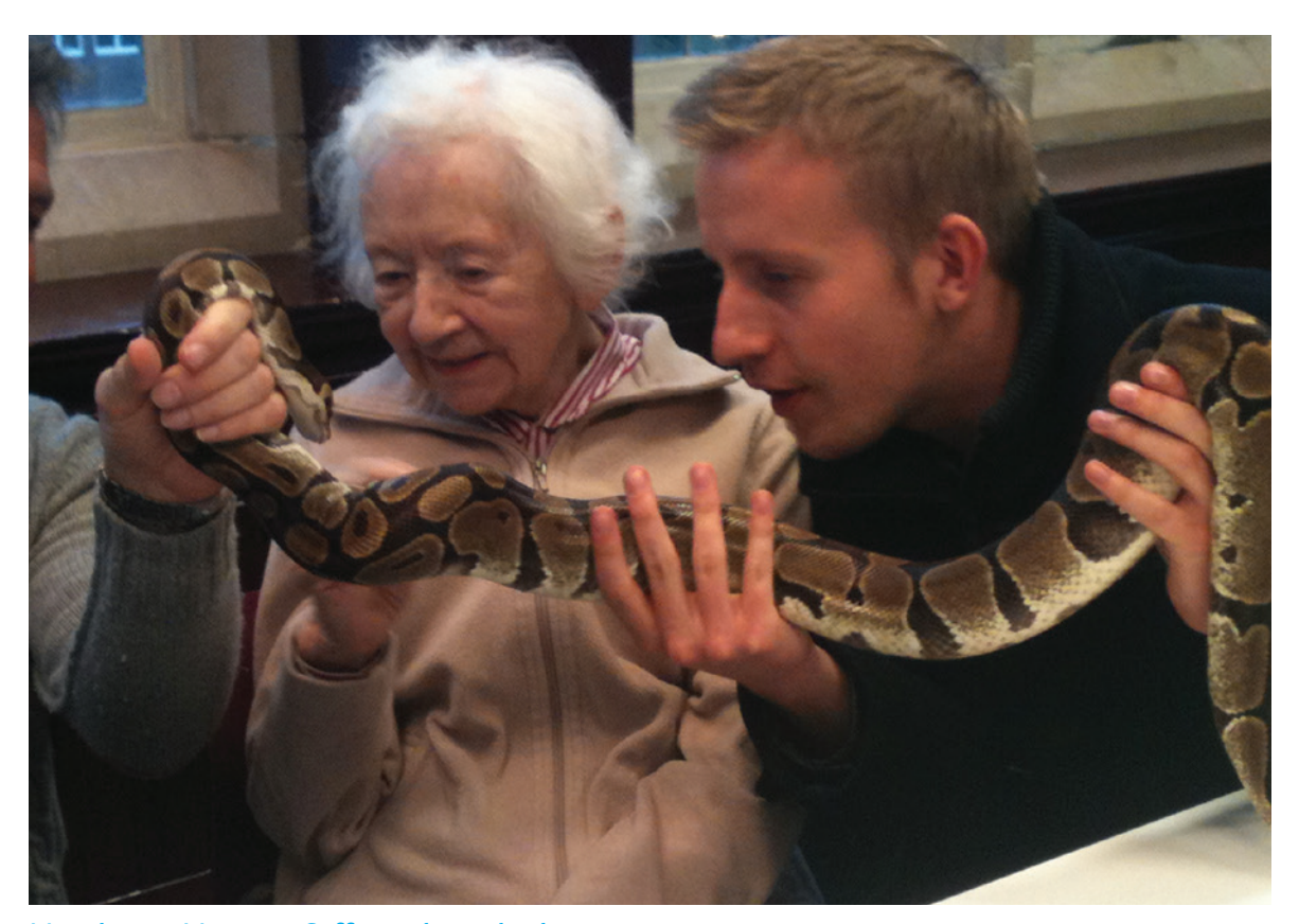
Manchester Museum, Coffee, cake and culture

Local voluntary agencies may have their own minibuses or may be able to broker group fares with minibus companies on your behalf. Local authorities may have special transport available or there may be community transport schemes to help visitors get to your venue.