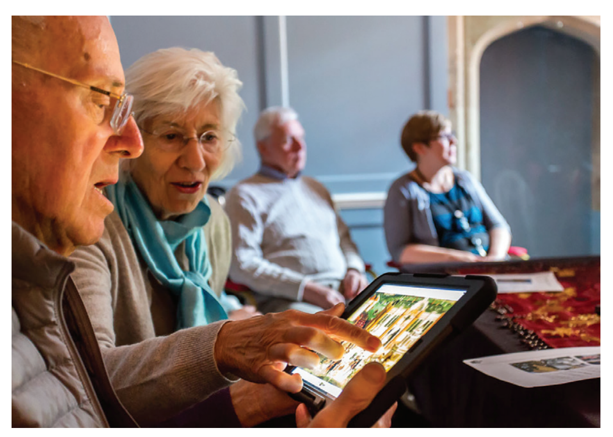
Historic Royal Palaces, Sensory Palaces

In addition, people may have other health issues alongside dementia – such as impaired hearing or mobility problems – that could affect their ability to get around your venue or appreciate what's on offer.