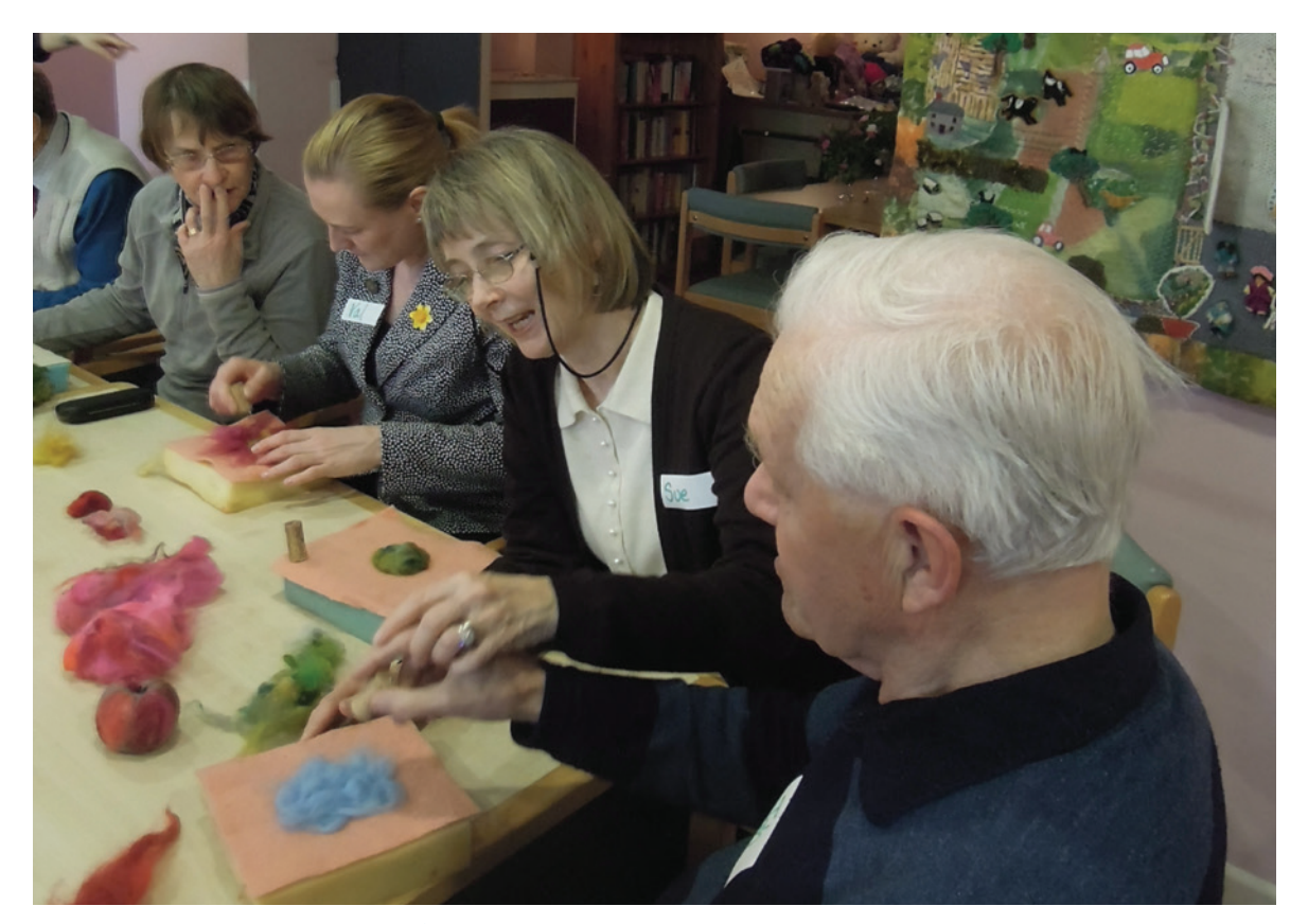
Creative Dementia Arts Network

This guide has been compiled by people with experience of helping arts venues to become more dementia friendly and we hope it will help your venue to take up the challenge.